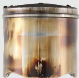
ECHO Power Blend @ 50:1