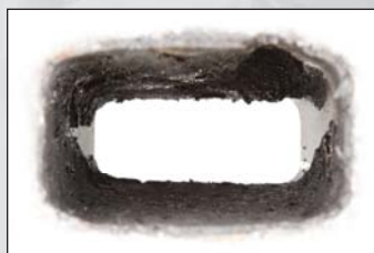
SABER Professional @ 100:1 4% Airflow Loss