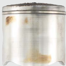
SABER Professional @ 100:1